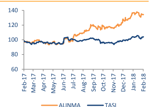
Price Performance (%)AbsoluteRelative1m(1.6%)(1.5%)6m23.2%18.4%12m37.7%28.3%Major Shareholders (%)General Retirement Organization10.71Public Investment Fund10.00